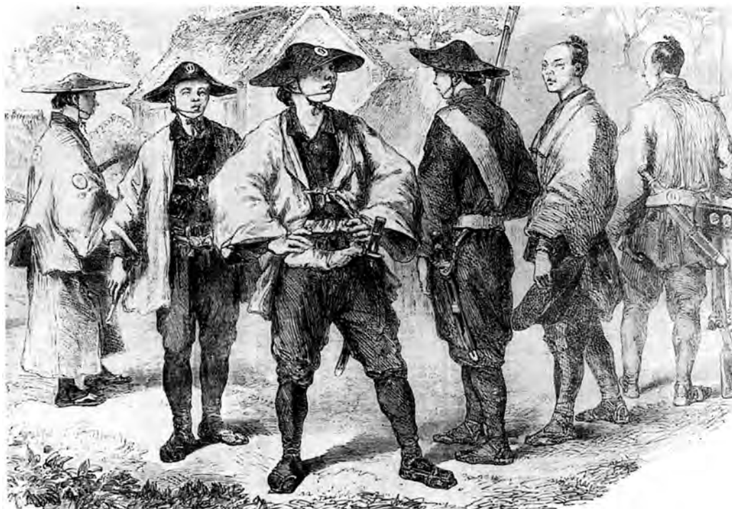
An illustration of Japanese soldiers in the 1860s in Western and traditional clothes.

4 Look at the illustration, and then answer the questions which follow.