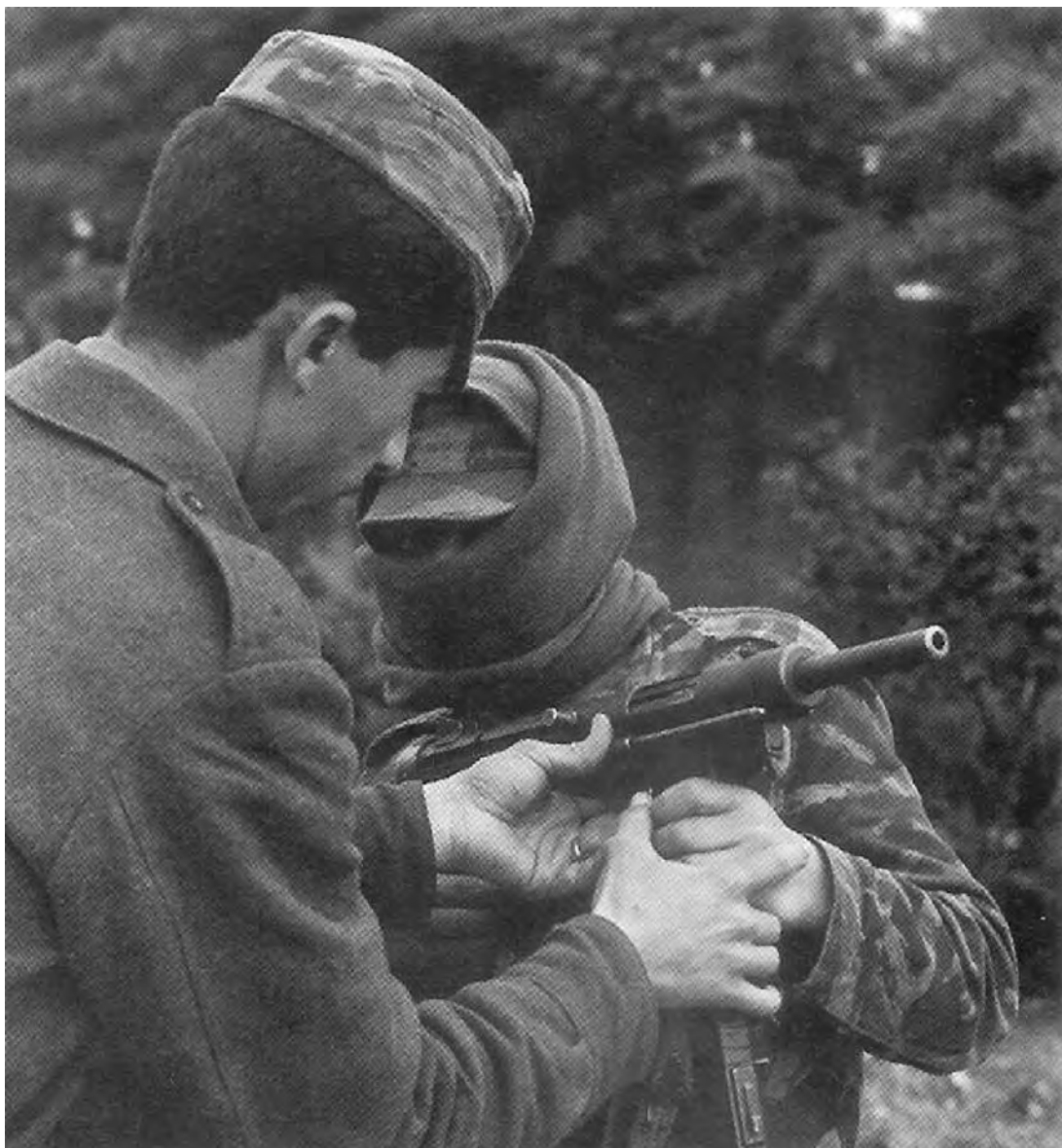
A young Fatah member receiving military training in 1966.

21 Look at the photograph, and then answer the questions which follow.