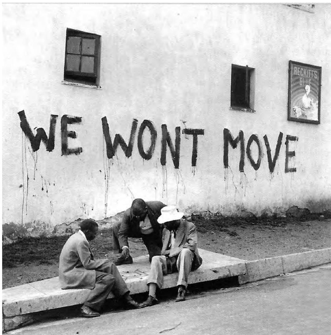
A photograph of the outside of a house in Sophiatown, 1955.

17 Look at the photograph, and then answer the questions which follow.