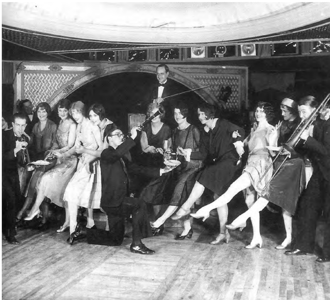
A photograph of young women dancing in 1920s America.

13 Look at the photograph, and then answer the questions which follow.