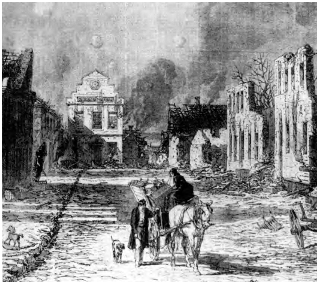
An illustration showing a Danish town in ruins after a bombardment by Prussian forces during the war of 1864.

2 Look at the illustration, and then answer the questions which follow.