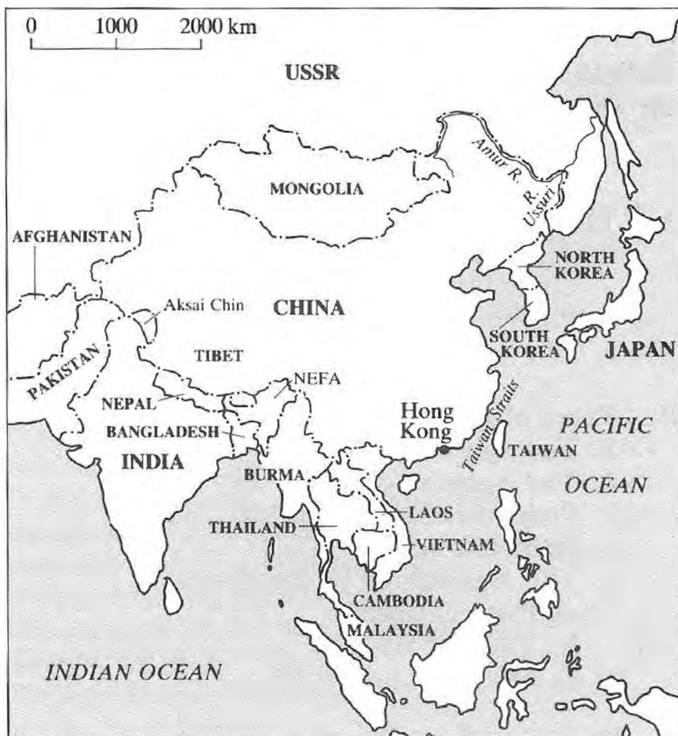
A map showing China and its neighbours.

15 Look at the map, and then answer the questions which follow.