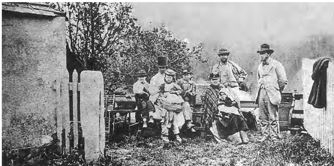
A photograph of a family of farm labourers taken in 1874. They have been evicted from their home. The labourers were members of the National Agricultural Labourers' Union.

23 Look at the photograph, and then answer the questions which follow.