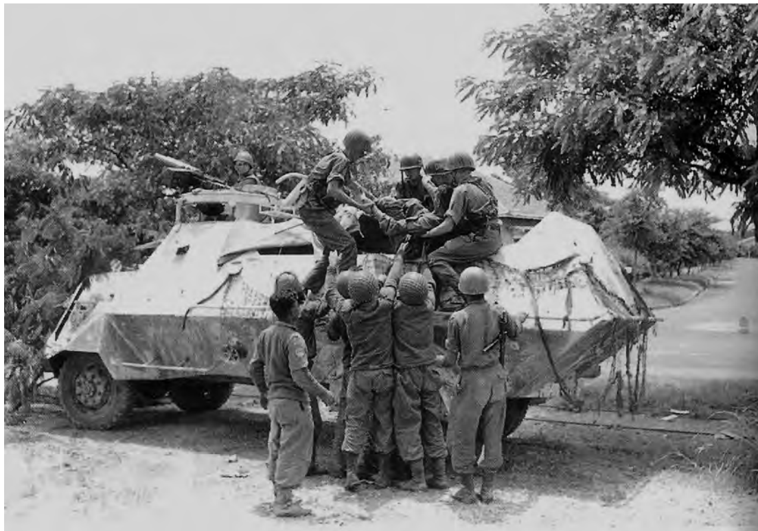
A photograph of a wounded soldier being lifted from a UN vehicle in the Congo in 1960.