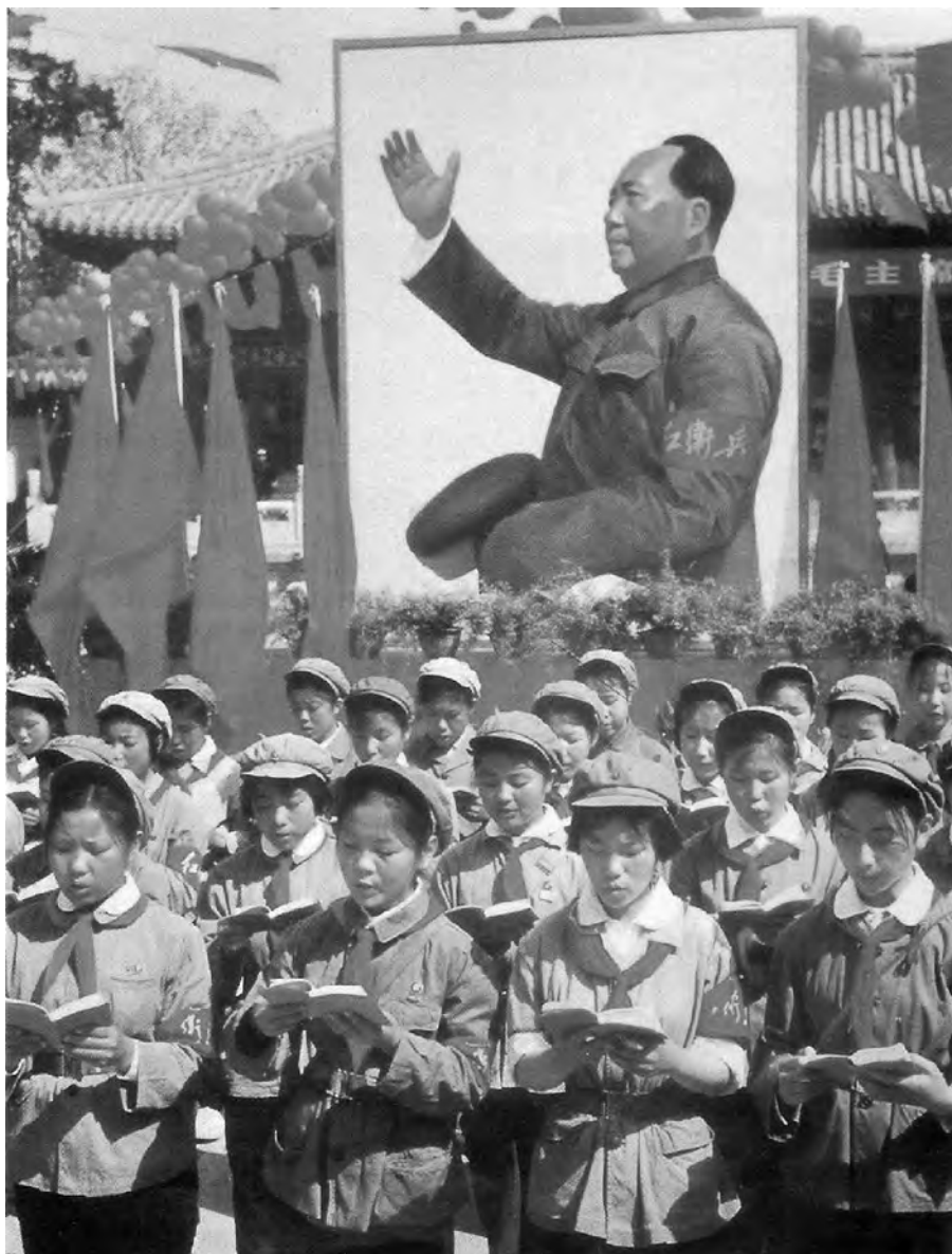
A photograph of Red Guards during the Cultural Revolution.

16 Look at the photograph, and then answer the questions which follow.