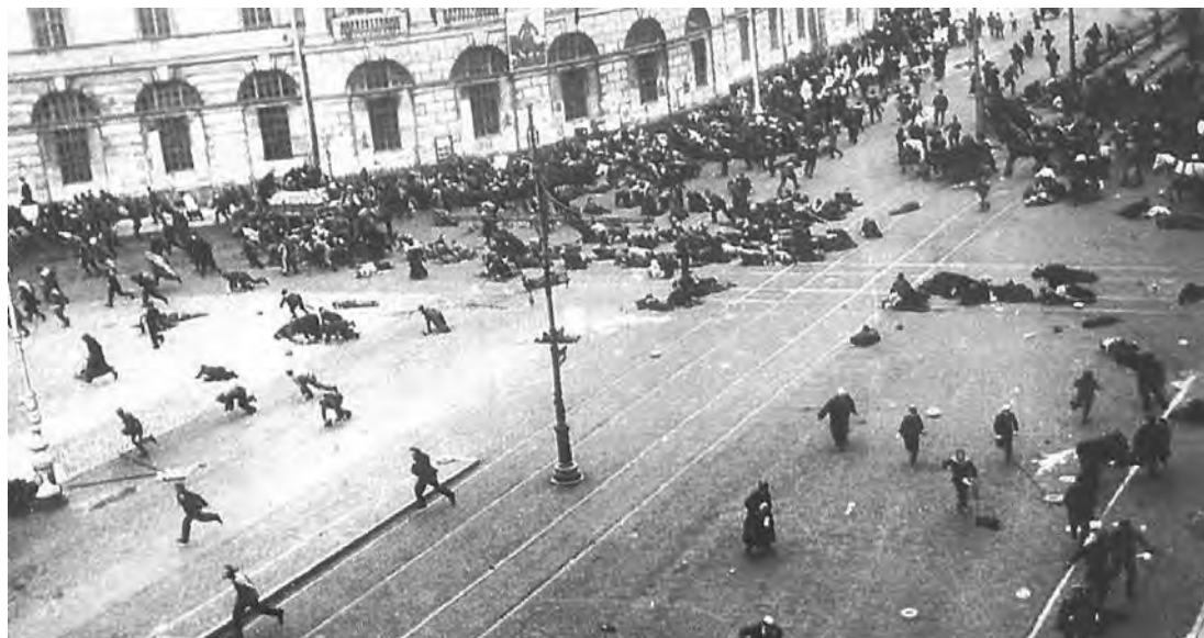
A photograph of troops firing on Bolshevik demonstrators in the streets of Petrograd, July 1917.

11 Look at the photograph, and then answer the questions which follow.